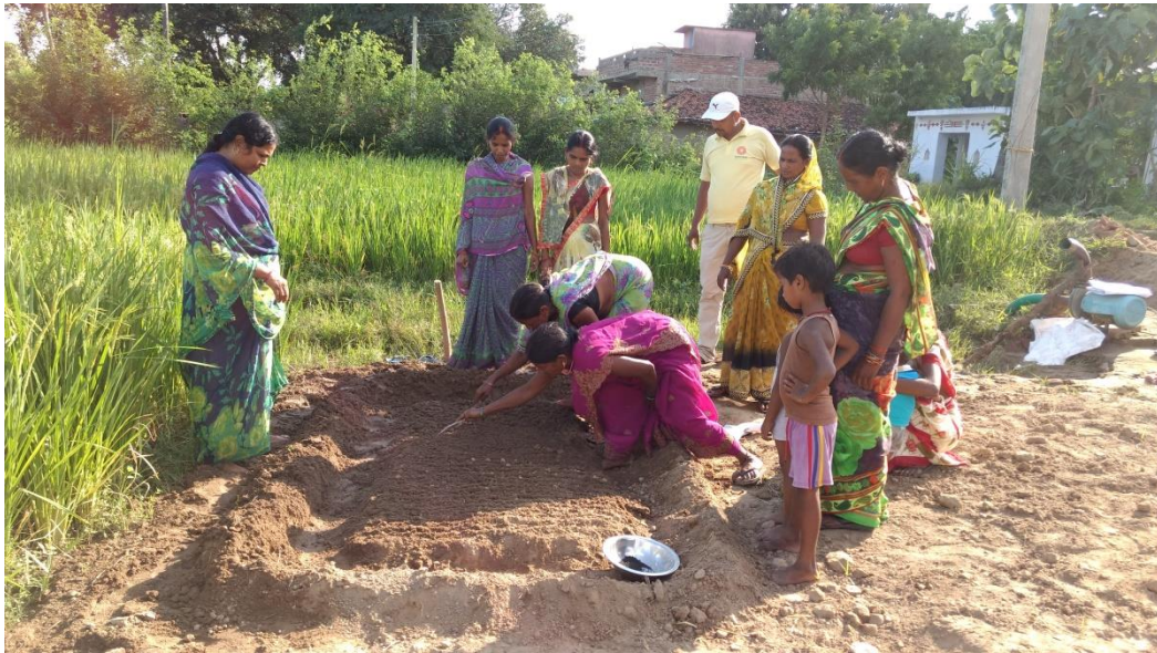
Fig 6: Training on Onion Crop practices in process at Saifganj, Bankey Bazaar, Gaya

WHAT: Agriculture extension is a staple of functioning food system. Farmers benefit from educational services that help them keep up-to-date on trends and best practices . One of the challenges bringing extension services to smallholders is infrastructure: rough terrain, inclement weather, and limited internet access prevent widespread knowledge dissemination.