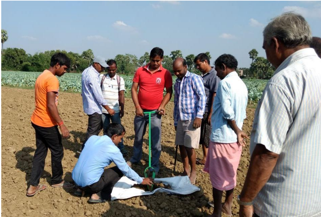
Fig 7: Soil Sampling training in full flow in Nawada Basti, Kharkhura, Gaya

As of now, we have trained more than 250 farmers on low-cost methods like seed treatment that enhances the immunity of plants by 90% and result in healthy produce.