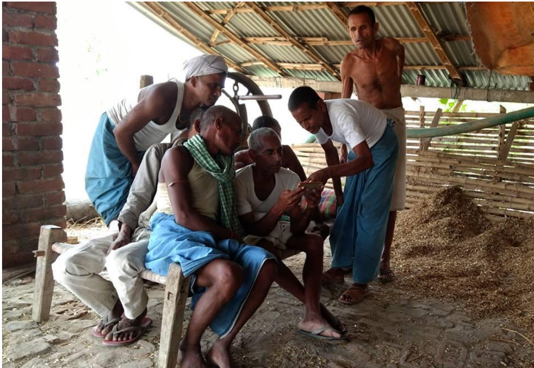
Fig 4: Community mobilization using technology as a medium. Behavioral Economics for Agriculture

We have observed, in 80% of our cases, financial literacy is very poor among the farmers; so using it as a tool to empower them helps in reaching out to people and make choices.