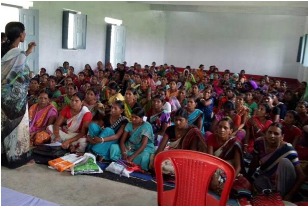
Fig 1: Field Manager doing the community outreach in Bankey Bazaar Block, Gaya, Bihar

Response in terms of community participation is not always immediate, it requires a lot of hardwork, determination and sweat to build trust among the communities. The success of any project rests on community involvement and mobilization of local financial, natural and human resources.