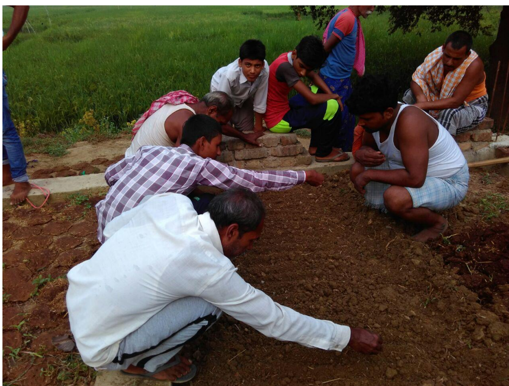
Fig 8: Trainings across different centres.