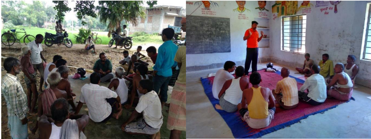
Fig 2: Community mobilization through Kisan Chaupal in Konch Block, Gaya, Bihar

In 2017-18, we reached out to more than 2500 farmers spread across 150 villages in 9 blocks of Gaya through direct outreach, conducting ' kisan chaupal(s) ' local organisations and self-help groups.