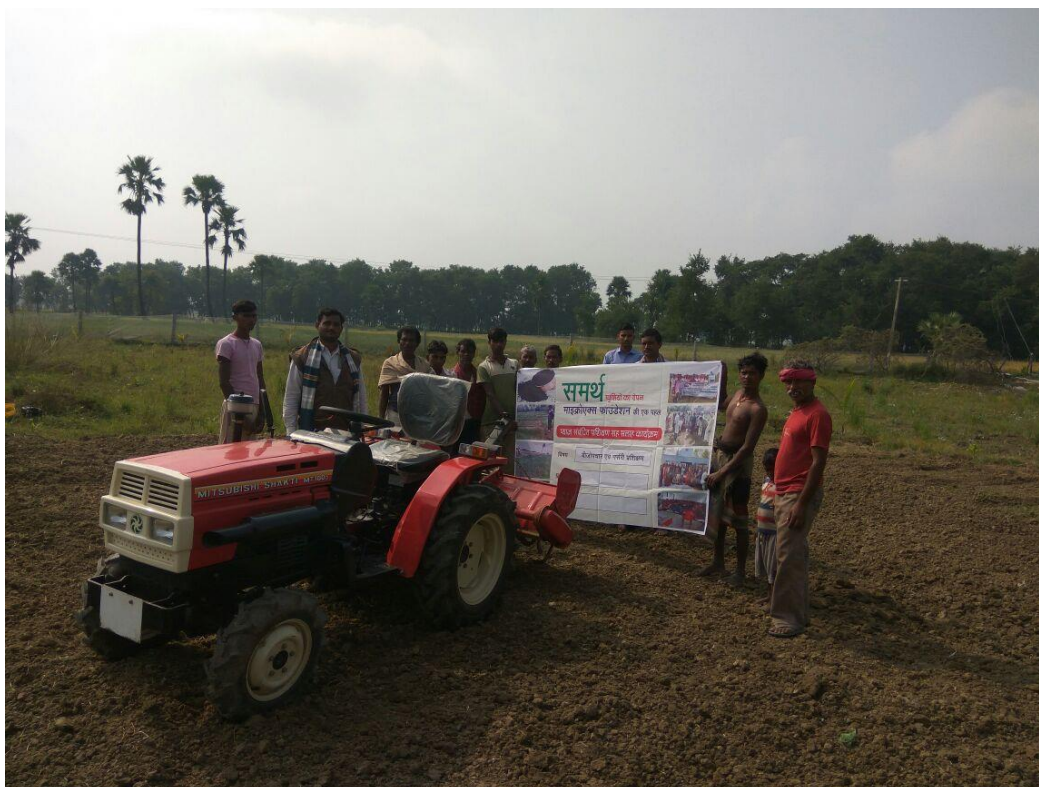
Fig 10: 18 HP tractor helps small holder farmers with affordability and make them safe from labour availability

It reduces the effort in time and increases productivity by 15%