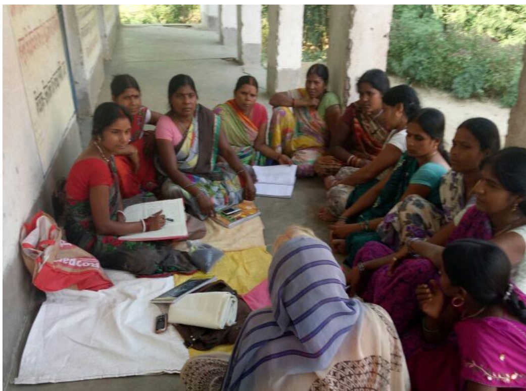
Fig 3: Community mobilization through Kisaan Chaupal in Konch Block, Gaya, Bihar