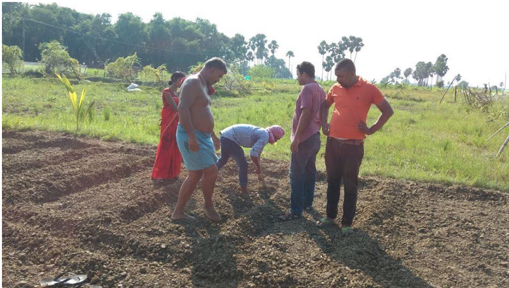
Fig 9: Our frugal innovations in extension system includes learning from the local wisdom and implementing it into our training programs in a dynamic ecosystem